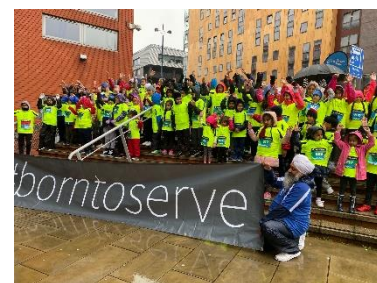
2019 141 runners, we are still fundraising!