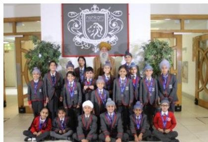
2017, our journey began 20 of us ran alongside Fauja Singh