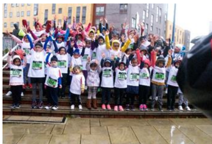
In 2018 46 children ran, promoting the charity Zero Hunger with Langar, we raised £2050