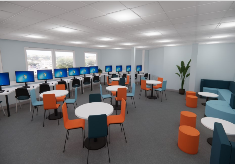
Sixth Form Study Space

At Nishkam School West London, we are preparing our students for their next stage of education and employment. The Sixth Form is designed to introduce our students to the professional world and provide opportunities to develop the softer skills needed for the modern world.